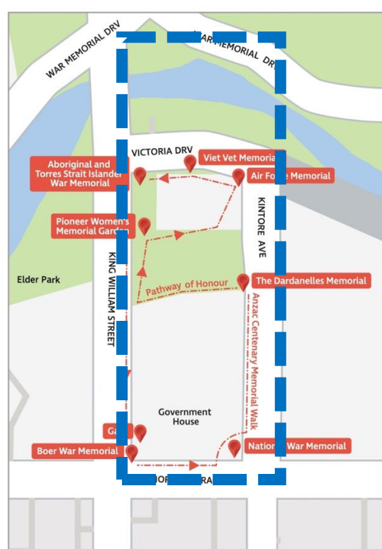
A. Core Torrens Commemorative Precinct (proposed) B. Broader commemorative precinct